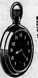
Radiolite—the lowest priced Radiolite—ideal service watch for outdoor workers, vacationists and boys. 1/2 actual size

Does your watch tell time in the dark? Ingersoll Radiolites do! The hands and numerals are coated with a substance containing real radium