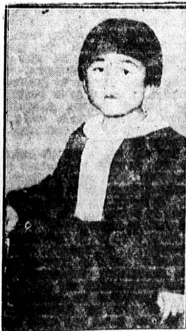
FUTURE JAPANESE EMPEROR

Jugoslavian police arrested a man over the week-end whom they accuse of having plotted to kill Premier Milan Stojadinovich. He was thought to have been marked by the same group which murdered King Alexander and Foreign Minister Barthelemy of France.