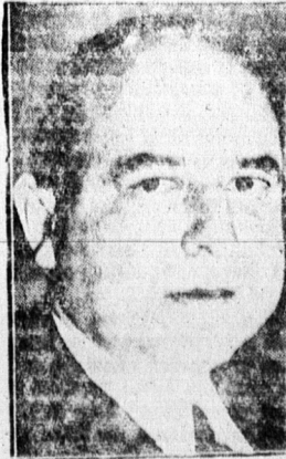
Stanley Reed, U. S. solicitor-general, has been nominated by President Roosevelt to fill the vacancy on the supreme court which resulted from the retirement of Justice Sutherland.