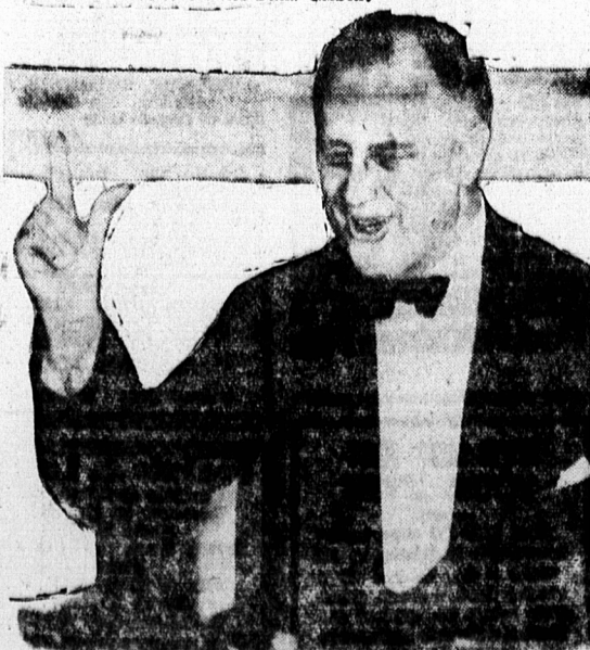
"Here is a 96-inch dog being wagged by a four-inch tail" — so President Roosevelt illustrated his Jack on Day dinner address in Washington recently when he attacked a minority which he charged intends to make a struggle "to the last ditch to retain autocratic control" over the country's economy.