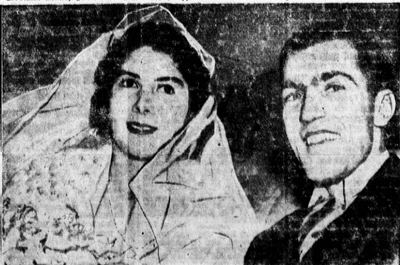
United States society found special interest in the recent wedding at Christ's Episcopal church in Wilmington, Del. The bride was the former duPont who married Franklin D. Roosevelt, Jr., III, young New York lawyer. This picture was taken as they settled back in their car on leaving the church.