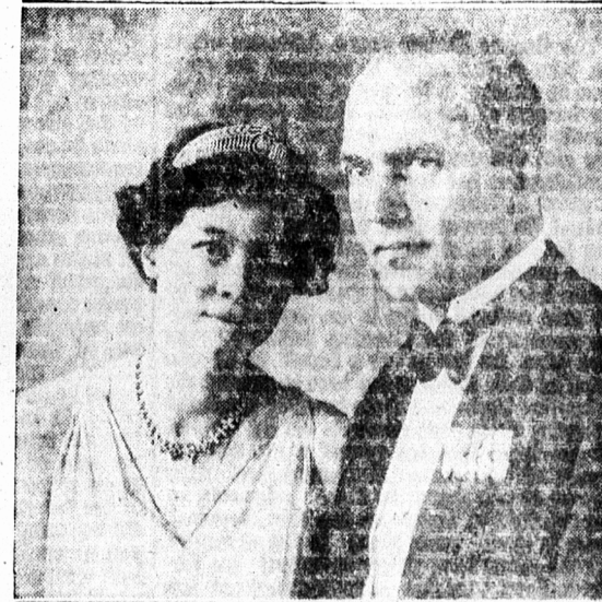
Crown Prince Paul of Greece and Princess Frederika of Hanover were married in Athens, Greece recently. The three best men were: Crown Prince Michael, 16-year-old heir to the Rumanian throne; Prince Peter, son of Prince George of Greece; and Prince Phillip, son of Prince Andrew of Greece. Other royal guests at the wedding included the Duke and Duchess of Kent, and Prince and Princess Nicholas of Greece. Our picture shows a charming portrait of Prince Paul and his fiancée, taken during their stay at Blankenburg in the Hartz Mountains, Germany.