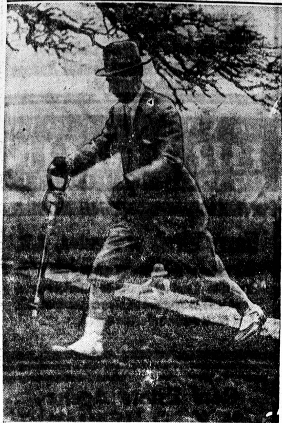
Premier Chamberlain is here seen in Masham, Yorkshire, where he was a guest at Viscount Swinton's shoot during the holidays. And some correspondents talk of the Premier not going to last long in office because he is "crippled" with gout! If he can do this with gout, what could he do if he was well?