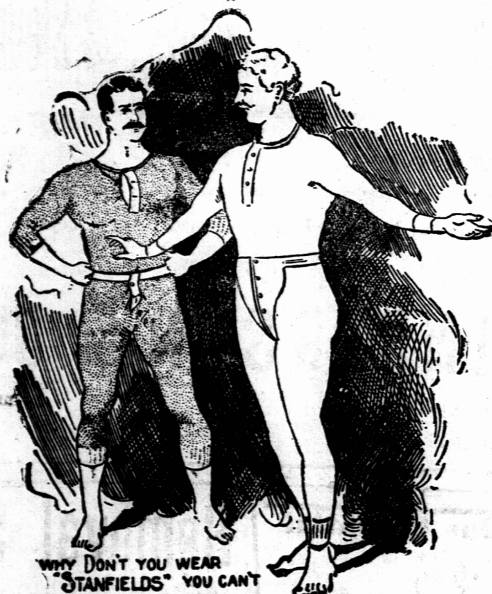
WHY DON'T YOU WEAR STANFIELD'S YOU CAN'T GET THAT SUIT WASHED AGAIN.