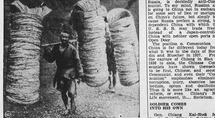
Transporting freight through free China.