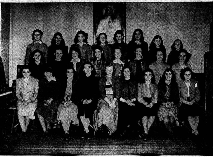
GRADES VII & VIII