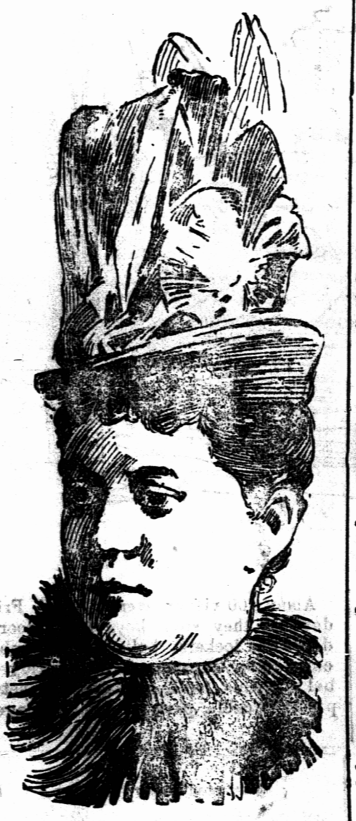
LADY SARAH WILSON. When last heard from she was making a two hundred mile ride from Mefeking.