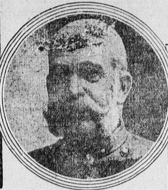
EMPEROR FRANCIS JOSEPH AUSTRIA