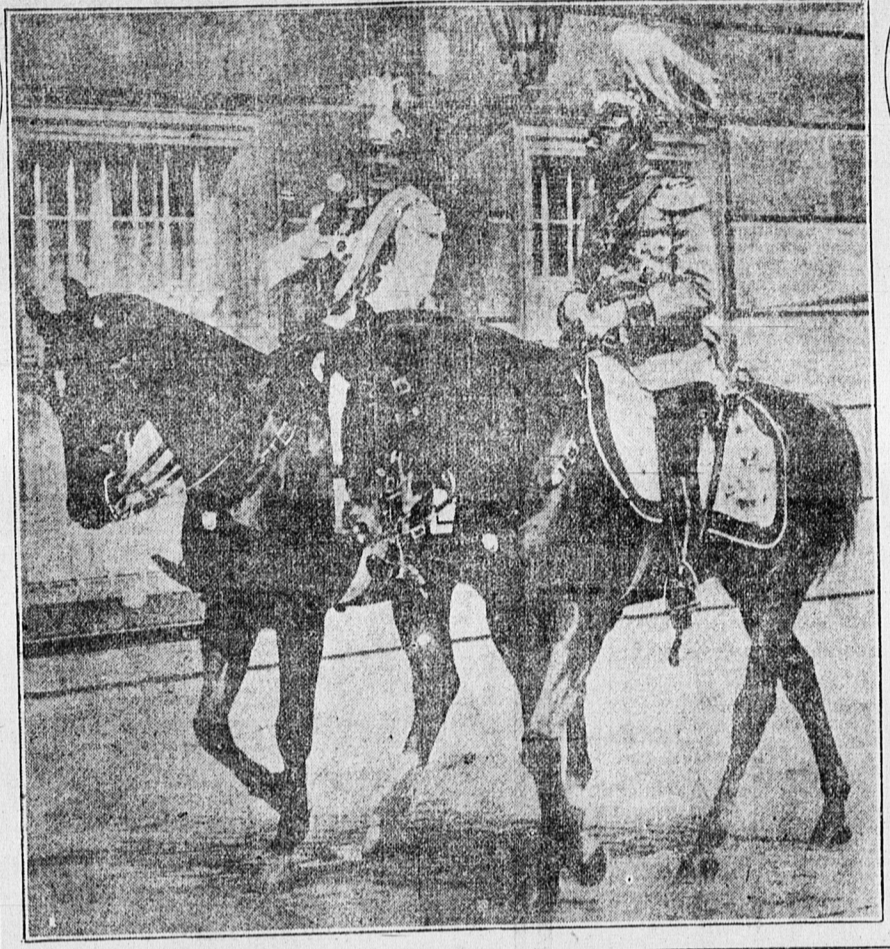
KAISER OF GERMANY AND KING OF ENGLAND PHOTOGRAPHED DURING THEIR LAST RIDE TOGETHER