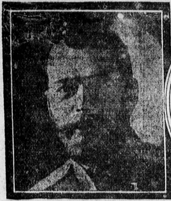
TSAR NICHOLAS RUSSIA