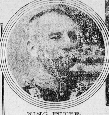
KING PETER SERVIA