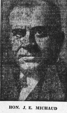
HON. J. E. MICHAUD

EDMUNSTON, N. B., April 13—(CP)—Fisheries Minister Michaud, who arrived home yesterday to urge a "yes" vote in his constituency of Resigouche-Madawaska on plebiscite day, has sent a circular letter to voters in the constituency.