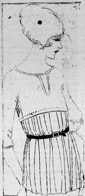
Tailored Blouse of Crepe de Chine. Embroidery, done in various bright shades such as red, green, blue, etc., cover

Still another very plain smock was of natural color pongee, with an all over sampler stitch embrod-