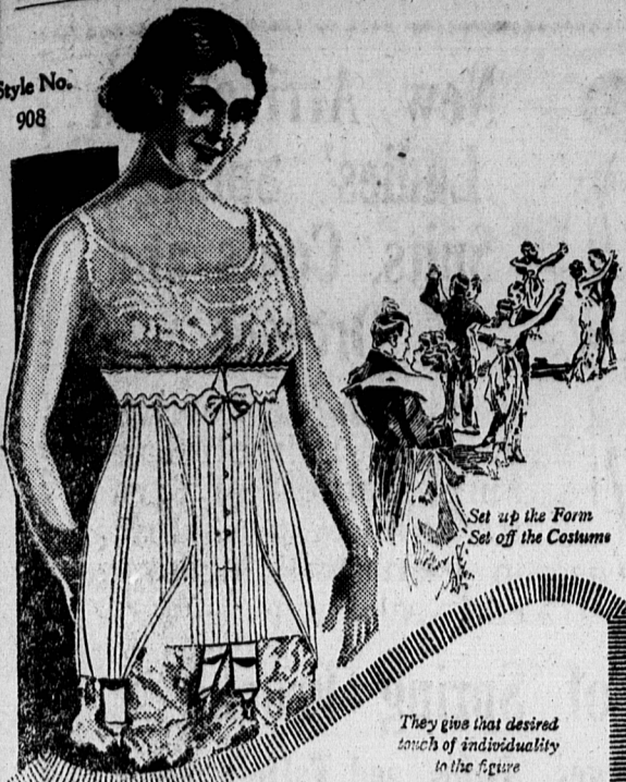
Set up the Form Set off the Costume