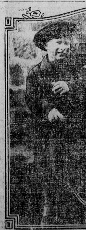
A comparative study in the children of royalty. Who would have thought, for instance, that at the time the photo on the RIGHT was taken the handsome little boy on the extreme LEFT would gain fame as the most successful Royal Comedico traveller? LEFT TO RIGHT none other than the Prince of Wales, Princess Mary, Prince Henry, and the Duke of York—all children of the King George and Queen Mary of England. But years pass and so in the illustration on the LEFT is given the latest photo group of Princess Mary's children, the Hon. George, Henry Hubert Lasselles, 4 years old, and Hon. Gerald David Lasselles, made at Coldborough, the Yorkshire home of the Princess Mary.