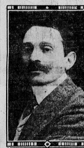
Eugene Chen, Cantonese foreign minister, and director of political and propaganda policies of the southern power. He studied at Oxford University.