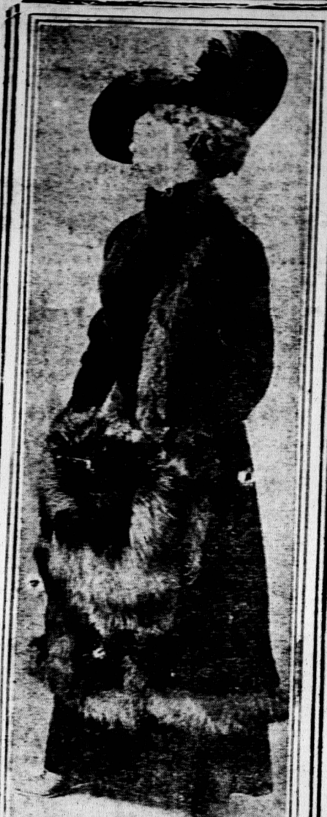
BY MISS WALSH OF "THE GIVENS SHAP" ON THIS exclusive street style for afternoon wear is in velvet. It is in Russian style, and is of black velvet bordered all around the coat with skunk fur. The big muff is of fox.

PROVINCIALISTS WIN MEDALS THROUGH TO GORGANDA.