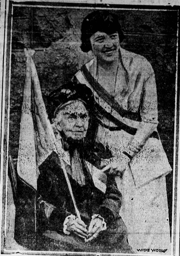
OLDEST AND YOUNGEST SUFFRAGE WORKERS AT THE REPUBLICAN NATIONAL CONVENTION

Wens, Cysts, Soft Bunches Reduced by "ABSORBINE JR." "ABSORBINE JR." is a vegetable germicide and antiseptic liniment. It is opposed to unhealthy, unnatural growths. Enlarged glands, wens, cysts, soft bunches are unnatural conditions that "ABSORBINE JR." will materially benefit. A prominent physician writes: "I have used ABSORBINE JR. on still joints and found it all right. Do the work nicely and I cheerfully recommend it." "ABSORBINE JR." should be in every home in case of accidents—heals cuts, burns, lacerations—ease sprains, strains and bruises—relieve pain and reduces inflammation. $1.25 a bottle—at most druggists sent postpaid by W. F. YOUNG, Inc., Lyman Building, Montreal.