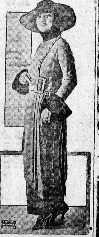
Fur Cuffs and Collar.

Don't be Short of Salt Malagash, crushed or lump rock salt will do your work and save you money, shipment by water or mail. Write for particulars to CHAMBERS & MCKAY Box 264, New Glasgow, N.S. 2608-11-24M11