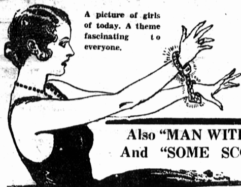
A picture of girls of today. A theme fascinating to everyone.

ELEANOR BOARDMAN CONRAD NAGEL LAURENCE GRAY