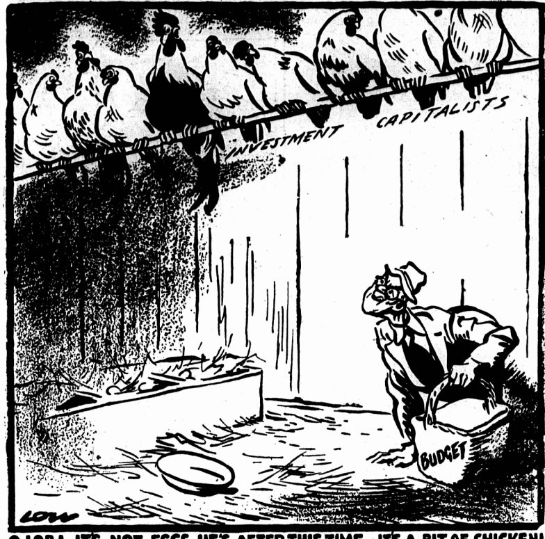
O LOR! ITS NOT EGGS HE'S AFTER THIS TIME - ITS A BIT OF CHICKEN! (Copyright in All Countries)