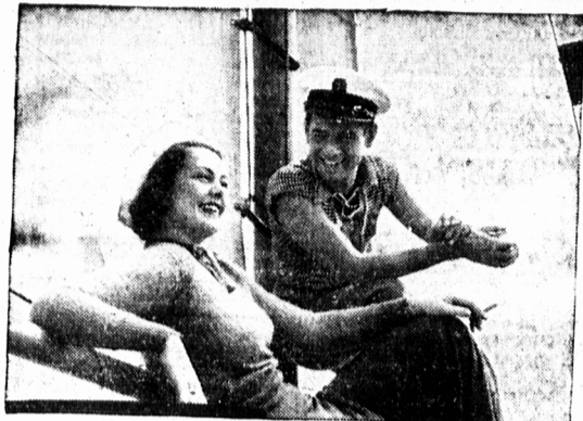
WITH "SAILS SET" FOR PLEASURE, BUCKINGHAM'S ARE REFERRED FOR