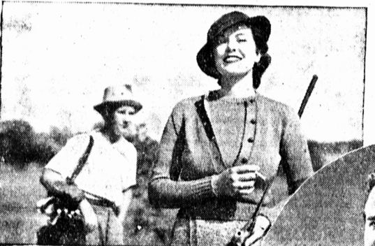
WITH GOLFERS, BUCKINGHAM'S ARE "PAR"—THEY'RE

WITH the younger set Buckingham's are favourites... for their subtle flavour difference—the rich goodness of selected tobaccos.