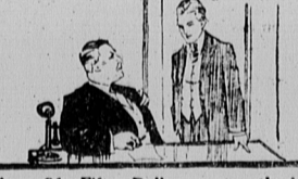
Age 21—Fifty Dollars a month is not enough.