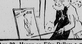
Age 20—Happy on Fifty Dollars a month.

How Fifty Dollars a Month looks to the Average Man