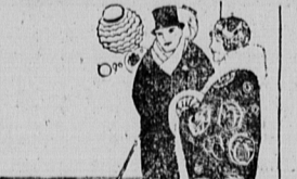
Age 35—Thinks he can easily afford to "spend" Fifty Dollars a month