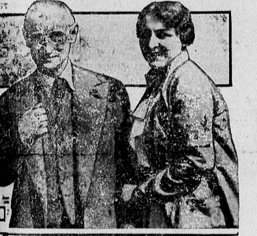
Lord Reading during their honeymoon on the Continent following their recent marriage in London. Lord Reading was former Secretary of India. Lord Reading is secretary of state for foreign affairs in the new British tri-party government.

Wool "frogs," not unlike the ones that used to be used on pajamas, appeared down the front of one coat suit. With this as with many other suits prominently featuring buttons and fastenings, there were only two or three of the buttons fastened while the rest remained more or less as trimming.