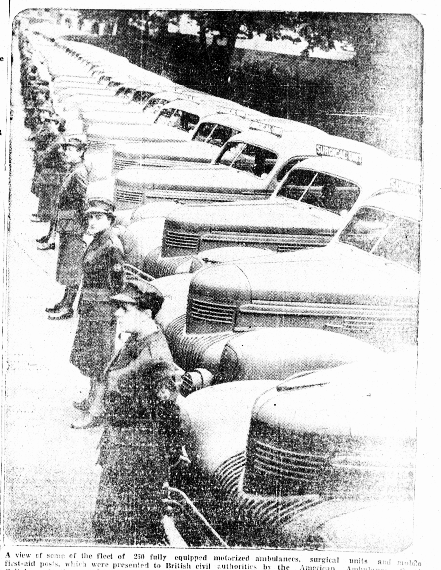
A view of some of the fleet of 250 fully equipped motorized ambulances, surgical units and mobile first-aid posts, which were presented to British civil authorities by the American Ambulance, Great Britain, at the organization's headquarters in Grosvenor Gardens, London, recently.