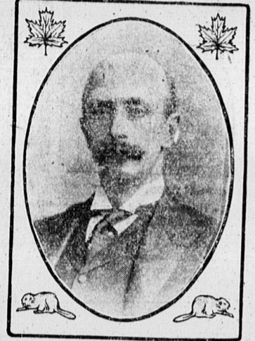
His Excellency Earl Grey, Governor General of Canada.