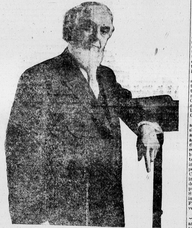
Pastor Russell of the Brooklyn Tabernacle.

the earth be removed, and though the mountains be carried into the midst of the sea." Fear is the great torment of the majority of our race. It is the lash which the Adversary frequently uses to drive something of this great Program, but he would keep this hidden from all others; hence the impossibility of explaining spiritual things to a carnal mind (I Corinthians ii, 14). "None of the wicked shall understand"