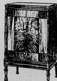
VICTOR-RADIO with ELECTROLA RE-45. The complete modern musical instrument. All-electric Radio and Victor Record reproduction. $375 complete with tubes.

But only a few out of hundreds of thousands of Victrola owners can be given this opportunity. Don't wait. Choose your new Victor Radio-Electrola today... and have the very latest. Telephone your Victor dealer NOW!