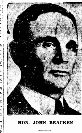
HON. JOHN BRACKEN

OTTAWA, Sept. 10 - Charges that the government has failed to demobilize the armed services on a fair basis, that it has failed to plan for speedy reconversion from a war to a peacetime basis, and that it has failed to meet the housing crisis were levelled in the House of Commons this afternoon by Opposition leader John Bracken in his maiden speech before Parliament.