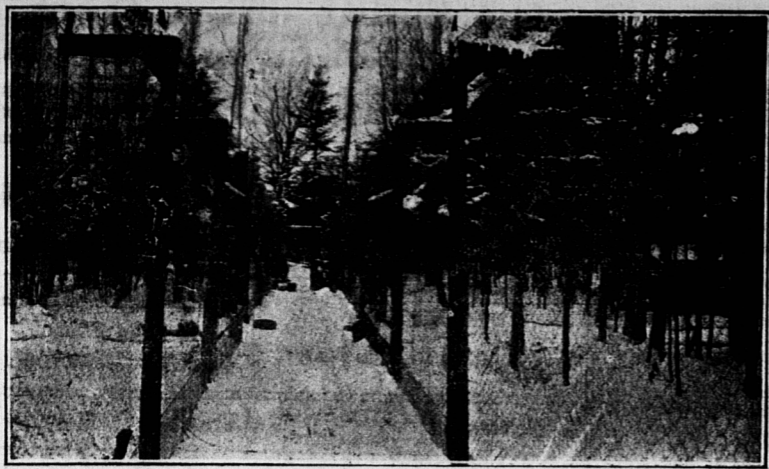
THE AGNEW RANCH.

Hundreds of shareholders in the "Provincial Silver Black Foxes, Ltd." received during the past week through the Royal Investment Exchange a cash dividend of Forty Per Cent and a further dividend on this year's operations will be paid in due course.