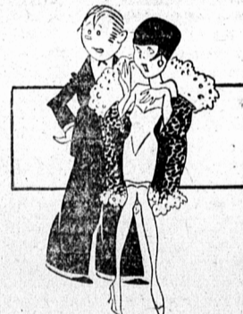
Wife: Do you like my new coat? Hubby: Yes but I'll bet I won't be able to say the same for the bill.