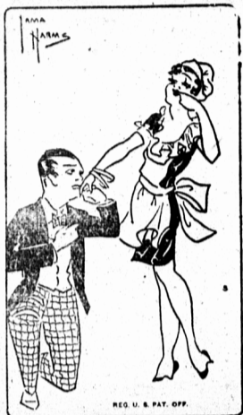
"The maid who listens to a rumor is liable to lose her job."