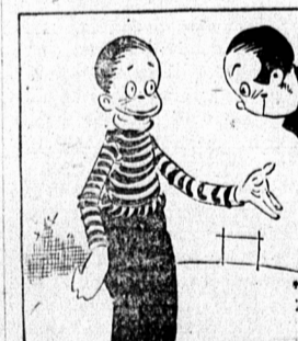
First Stud: The line on our team is like a stone wall. Second Stud: It sure is—and every fellow in it's a brick.

FRIENDLY WARNING Ladybird, ladybird, fly away home! Ten people have called since you started to roam. Each one is trying your mansion to rent. And the landlord on making his profit is bent.