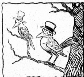
"There's that new Zepplin." "Yes, it's a fine ship but how would you like to buy gas every time you take off?"