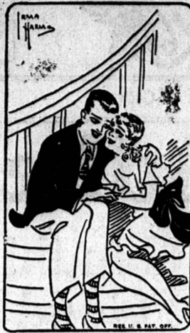
"Even jazz dancers like the old 'pepe best'."