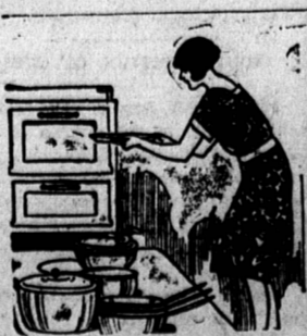
ALL THE KITCHEN UTENSILS