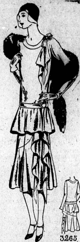
A particularly gracious frock in black silk crepe with youthful peplum that falls in cascading jabot effect

down left side of skirt. The fitted bodice rather suggests a basque with narrow belt marking normal waistline. The jabot treatment of skirt as echoed in jabot caught at left side of collarless neckline, that is finished with applied band. The circular skirt shows diagonal trend.