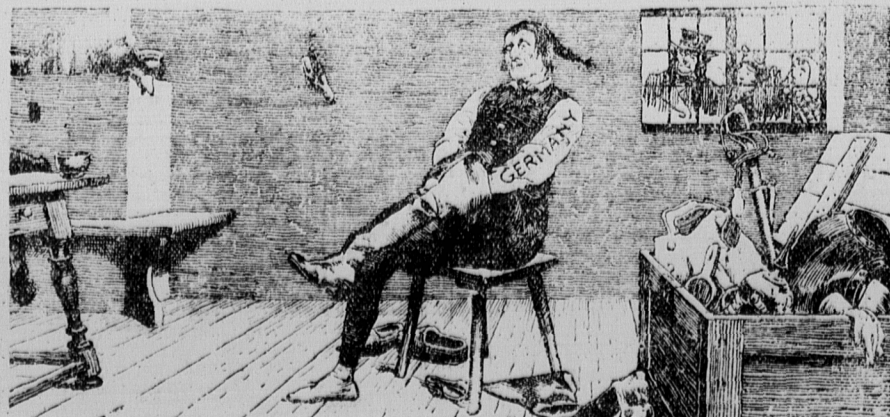
"HE'S PUTTING ON HIS ARMOR AG AINI"