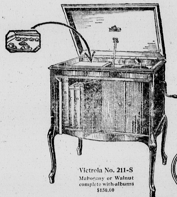
Victrola No. 211-S Mahogany or Walnut complete with album $150.00