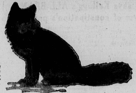
"We have used Dry Yeast for the past six months and our foxes have never been in better condition."