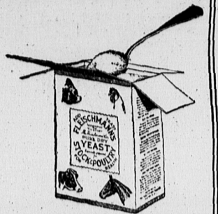
Copyright, 1925, The Fleischmann Company