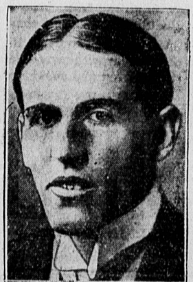
LIBERAL JOINS CABINET Sir Godfrey Collins, a Liberal of the faction led by Sir John Simon, and who has been appointed to take the place of Sir Archibald Sinclair, as secretary for Scotland in the cabinet of Premier Ramsay MacDonald. Sir Herbert Samuel and Viscount Philip Snowden resigned from the cabinet, in protest against the tariff policy which culminated in the agreements negotiated at the Ottawa Imperial Economic Conference recently.