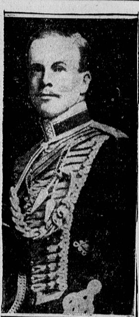
EARL OF BESSBOROUGH Canada's Governor General, who will officially open the special session of Parliament today.