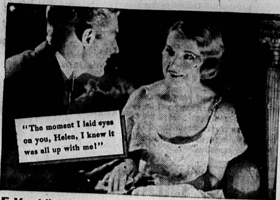
Men fall in love with the sweet, natural loveliness of the clear-complexioned girl. She is the girl they want to marry.