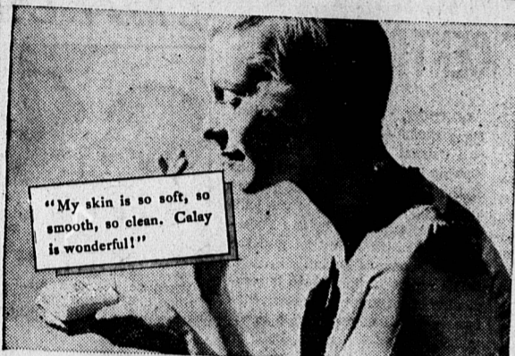
Get a dozen cakes of Calay today. Use them to the exclusion of all other soaps. Long before they are gone, your skin will have a new beauty—a beauty known only to a skin that is free of dirt.

A brief minute with Calay's generous lather and warm water. Rinse with cold water. Your skin is satiny smooth. All dirt has left the pores. Get a dozen cakes of Calay, the one soap praised by 73 leading skin doctors. You need Calay to face your perpetual Beauty Contest!