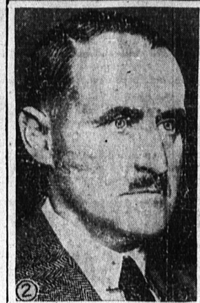
"The loss of life and injury is simply appalling. Statistics for Ontario show that in a single twelve months there are as many killed by automobiles as would constitute a regiment of soldiers."