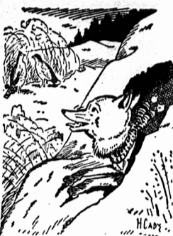
Reddy was quivering with both excitement and desire.

It was a white world and very lovely in its whiteness. But Reddy Fox didn't think so, and there were others in the Green Forest who didn't think so. They didn't see anything lovely about it. All of them were too hungry to see loveliness in that which was making them hungrier and hungrier, snow, too much and too soft, was doing just that.