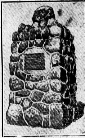
The striking monument which was erected at Dundas, Ont., as a tribute to the memory of the late Sir William Osler by the Hamilton Medical Society. Dundas was the birthplace of the famous physician.