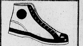
"RUSTLER" Men's, Boys' and Youths' sizes. Re-ly-on Sole.