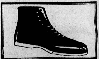
"MOTOR" Men's, Boys', Youths', Women's, Misses' and Children's sizes. Balmoral and Oxfords. Crepe Sole.