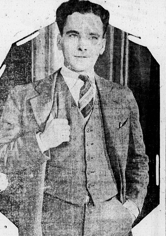
"Of course she likes it," Clay answered for Billy.