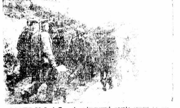
GUERRILLAS and underground agents spring to action behind lines in occupied countries.