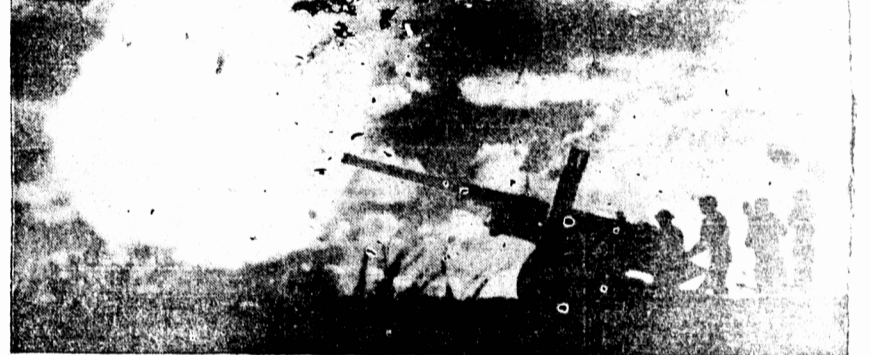
GUNS of the field artillery and other mobile weapons shell enemy positions, knock out his tanks to clear the way for our advance. Engineers fix roads, bridges as enemy retreats.