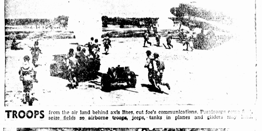
TROOPS from the air land behind axis lines, cut foe's communications. Paratroops come from the sky to seize fields so airborne troops, jeeps, tanks in planes and gliders may follow.