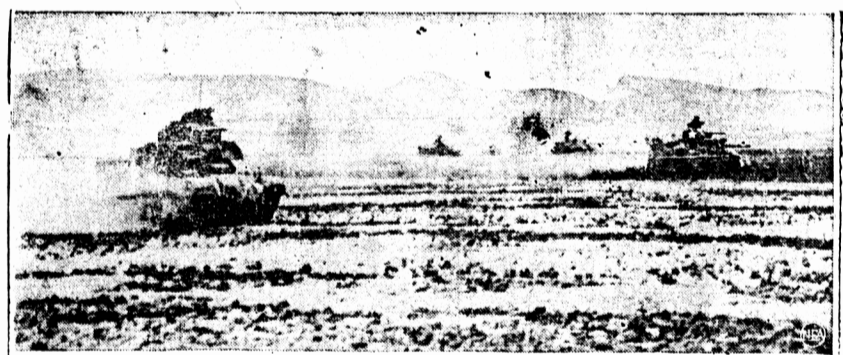
TANKS fight the big land battles, crash the enemy's defenses, knock out his armor and spearhead the advance. Jeeps, trucks, half tracs and infantry support the tank advance.