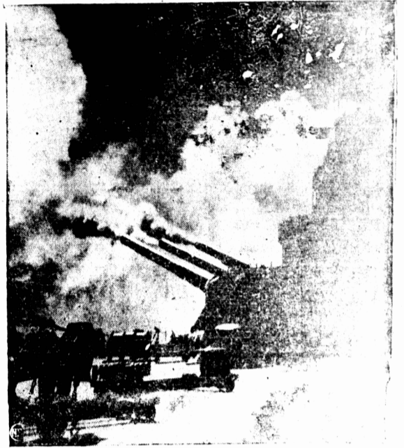
WARSHIPS guard convoys, engage the enemy and shell axis defenses.