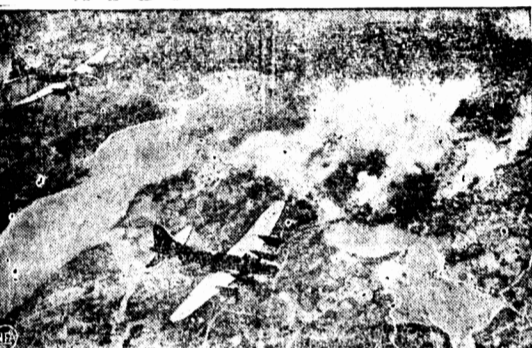
BOMBERS blast enemy's guns, troop concentrations and installations to soften up area for attack.