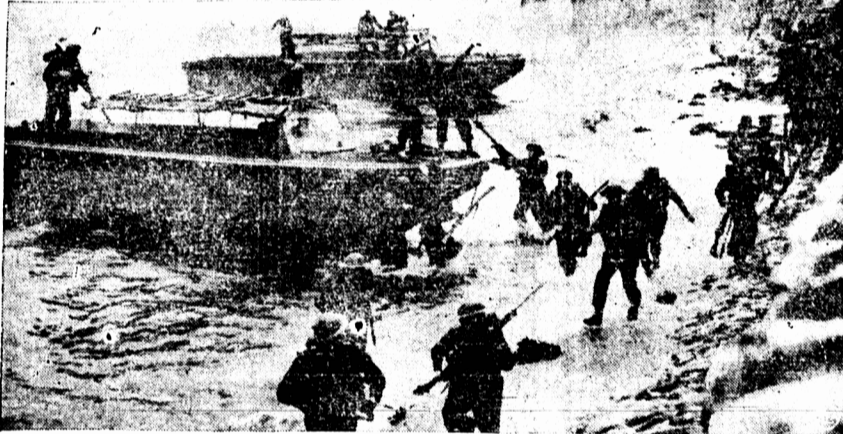
TROOPS from the sea swarm ashore from invasion barges launched by the convoy ships. Initial landing groups establish beachheads so larger forces can land and push inland.