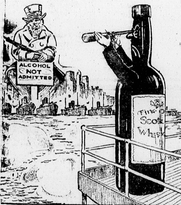
THE MODERN COLUMBUS. Trying to discover a place to land in America.