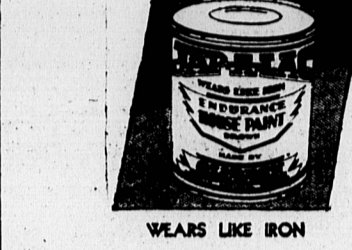
WEARS LIKE IRON

Try out for yourself the Jap-a-lac Paint. By rubbing between finger and thumb, get the smooth feel of it; that is the proof of fine grinding of the base materials.