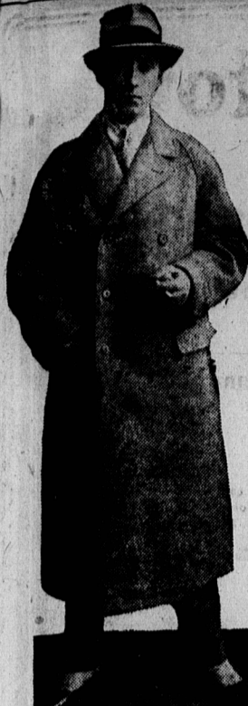
Another Royal Rancher

281 Pages—42 Illustrations. FREE COUPON FOR BROCK'S BIRD SEED AND BOOK. Messrs. Nicolson & Brock, Limited, 115 B Market St., Toronto, Ont. Dear Sirs—Please send enclosed 10 cents to cover packing and postage on a FREE copy of "Brock's Book on Birds," a FREE sample of Brock's Bird Seed (one week's supply) and a FREE sample of Brock's Bird Treat. Name: Address: