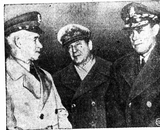
CHIEFS OF STAFF IN JAPAN — Gen. Douglas MacArthur (center) welcomes Army and Air Force chiefs of staff to Tokyo as the high-ranking officers arrive for a survey of the Far East. At left is Gen. Omar Bradley, chairman of the Joint Chiefs of Staff, and, at right, Gen. Hoyt Vandenberg, chief of staff of the Air Force.