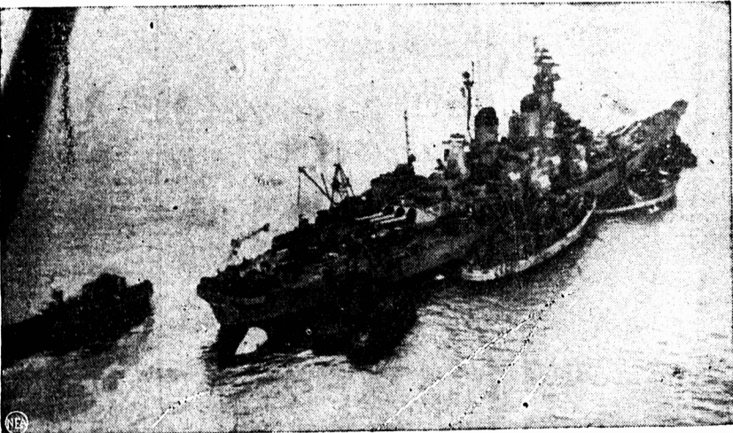
LOOK, MA, IT FLOATS — It took two weeks, 21 tugs, high tide, straining winches and a brisk northeast wind to do it, but the USS Missouri is finally freed from a mudbank in Hampton Roads, off Norfolk, Va. The battleship slips afloat sternward, and was taken to the Navy Yard at Portsmouth for inspection in dry dock.