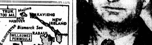
Map showing shipping routes and locations in the Bismarck Sea region, including New Ireland, Rabaul, and Milne Bay.