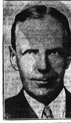
HON. WILLIAM PHILLIPS

Reports were revived in Ottawa that Canada and the United States were renewing efforts toward a re-approxy treaty and toward further discussions on the St. Lawrence waterways project, by a visit to the capital of Hon. William Phillips, United States undersecretary of State. Reports were revived in Ottawa that Canada and the United States were renewing efforts toward a re-approxy treaty and toward further discussions on the St. Lawrence waterways project, by a visit to the capital of Hon. William Phillips, United States undersecretary of State.