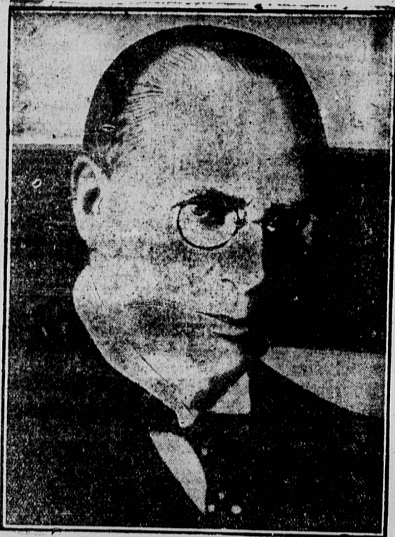
HON. R. B. BENNETT, K. C. M. P., LL. D.

SPEECHES WILL BE BROADCAST FROM STATION C. F. C. Y.