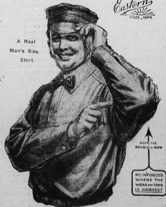
A Real Man's Size Shirt