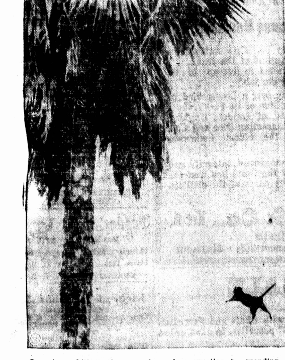
Queenie, a kitten who caused much commotion by spending six senseless days atop a 60-foot palm tree in Los Angeles in what was feared to be a suicide attempt, is shown in mid-air as she dropped from the tree into a rescue net. Legs of one of rescue workers can be seen on trunk. Tree had to be shaken violently to force Queenie to evacuate, and she escaped her rescuers before she could be fed.