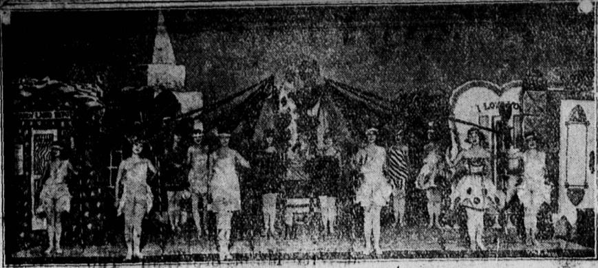
"CANDYLAND" ONE OF THE NOVEL AND DISTINCTIVE SCENES IN THE MUSICAL HIT OF THE SEASON "LISTEN TO ME" AT THE PRINCE EDWARD TONIGHT AND THURSDAY