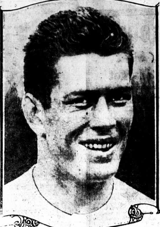
Smiling Gene Tunney the new world's heavyweight champion, who on Friday was given the judges' decision over Jack Dempsey, the former world's champ, in a 10-round title bout at Philadelphia.

Extra parts on hand. Write or phone 798 or 838