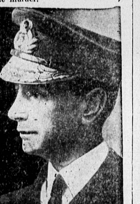
Admiral of the Fleet Sir Roger Keyes charged recently in parliament that he had offered to smash his way with naval units into the fjord at Trondheim but that his offer had been refused by the admiralty. Such action he said, might have meant victory.