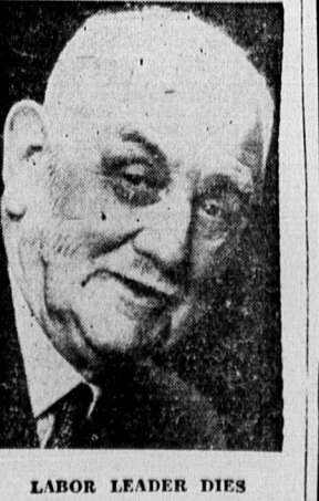
LABOR LEADER DIES - George Lansbury, famous for a generation as one of the leading figures in Great Britain's Labor party, died May 7. Famed as a radical, he was nevertheless a monarchist and devout churchman. His was said to be "the only name that is known and loved in every town and village of Great Britain."