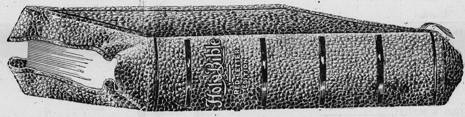
CUT SHOWS FULL SIZE Specially Bound in Genuine Limp Bible Leather, Folding Cover, Red Edges, Round Corners, Gold Lettered Back, Full Size 9 1/2 x 6 3/4 inches.