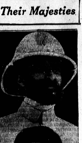
Sir John Simon Plans Diplomatic Tour Of European Capitals.

(C. P. by Guardian's Special Wire) PARIS, Feb. 22.—The French Chamber of Deputies by standing German accord on transfer of the Saar territory to Germany, signed at Naples Monday.