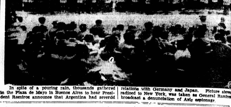
In spite of a pouring rain, thousands gathered in the Plaza de Mayo in Buenos Aires to hear President Ramiroz announce that Argentina had severed relations with Germany and Japan. Picture above, radioed to New York, was taken as General Ramiroz broadcast a denunciation of Axis espionage.