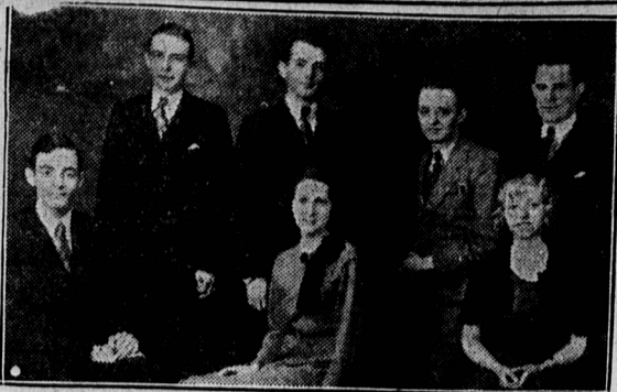
Mount Allison "Little Theatre" Group, which presented "The Valiant" in Ottawa at the Dominion Drama Festival, Thursday evening, April 27, 1933.

UNDERTAKER EMBLAKER Charlottetown and North Wilshire Phone 149